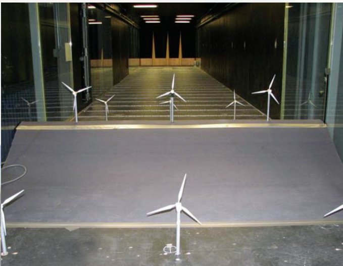
Wind turbines in the aeronautic and atmospheric boundary layer wind tunnel aligned to simulate a wind farm in complex terrain.

Sponsors: DOE, ISU Electric Power Research Center, Power System Engineering Research Center, Bonneville Power Administration, Southern California Edison Company