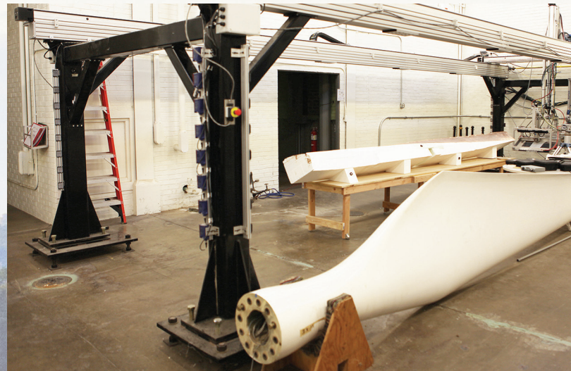
Fabric layup equipment for studying advanced manufacturing techniques